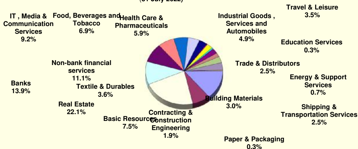
Fig (21): Sectors in terms of Value Traded (31 July 2022)